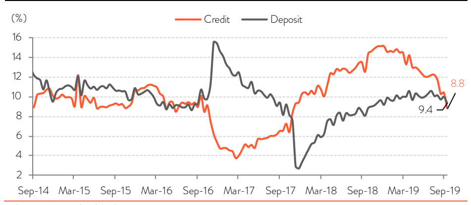
FIG 1 - CREDIT AND DEPOSIT GROWTH IN THE BANKING SYSTEM

Bleak outlook for FY20: We do not expect any material improvement in credit growth for FY20. At the same time, as PSBs grapple with the mega consolidation exercise, private banks will be able to step in and augment market share.